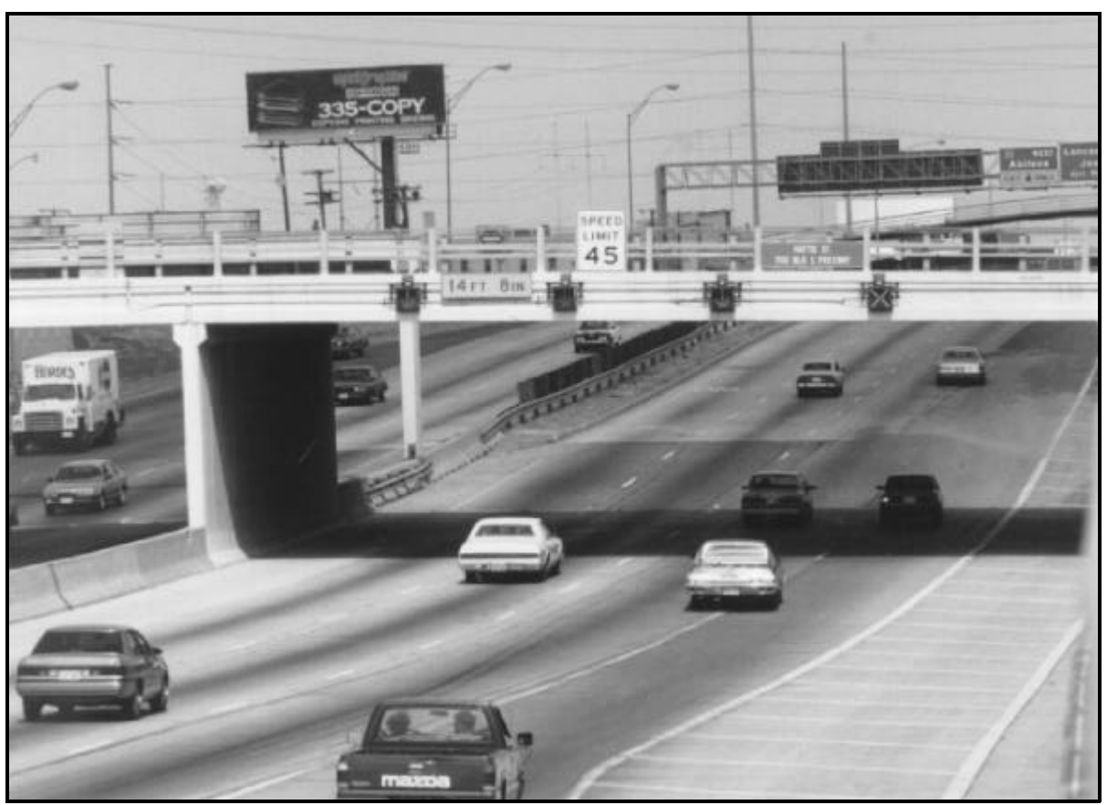
Figure 4-3. Typical Freeway Lane Control Signal.

In contrast to LCSs that display a rather small number of colors and symbols, fullmatrix DMSs are capable of providing a large number of descriptive messages to indicate that one or more travel lanes are closed downstream, that a freeway shoulder can be used as a temporary travel lane, that an HOV lane is open to mixed-use traffic (as might occur during a major incident), or that trucks normally restricted to a right lane can use other travel lanes as well (as also might occur during a major incident).