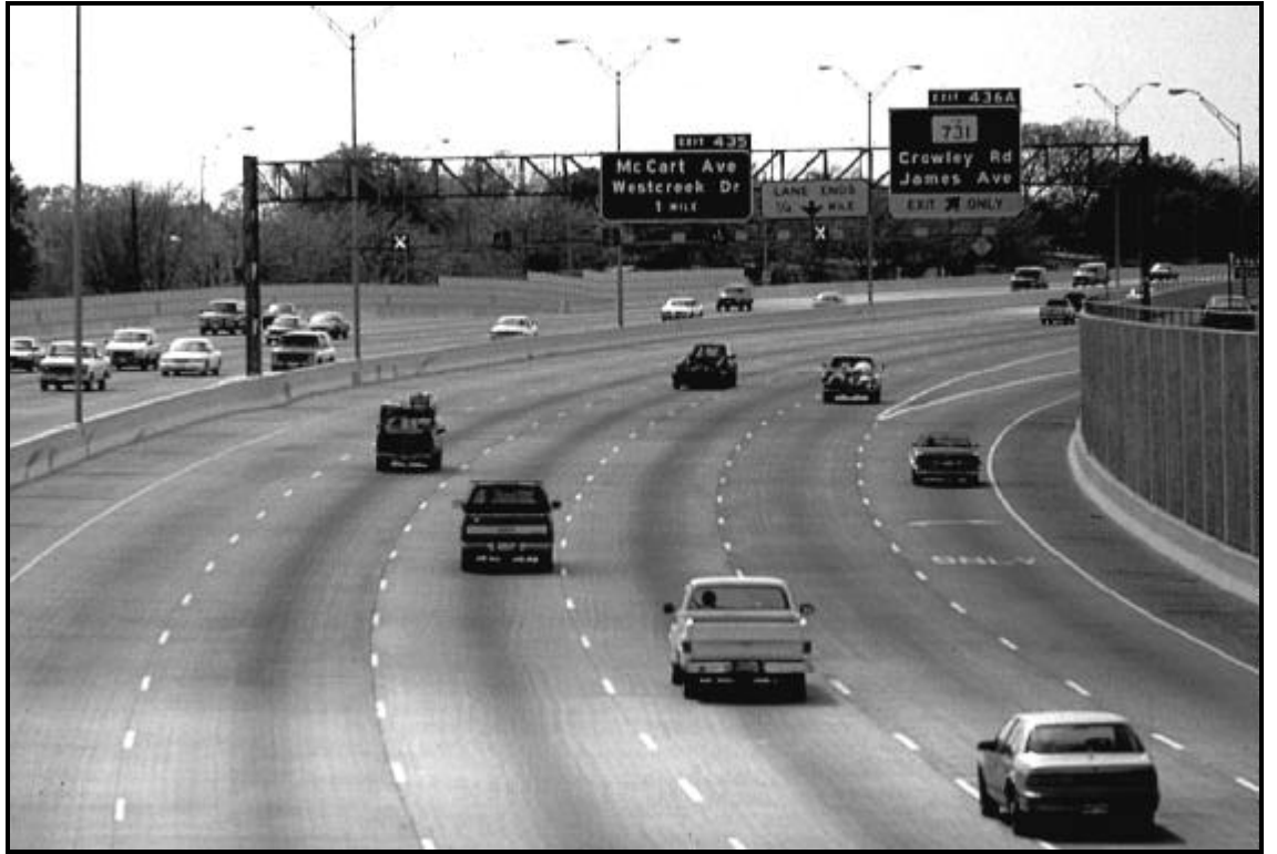
Figure 4-1. Proper Lane Use Control Can Facilitate Safe and Efficient Operations.